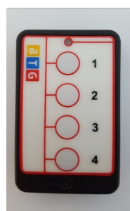
Options for 1 to 4 Buttons