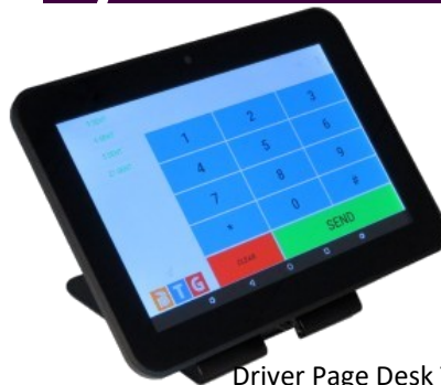
Driver Page Desk Top & Portable Tablet Call Point