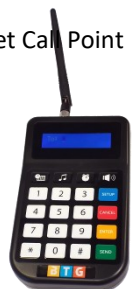
Desk Top Transmitter