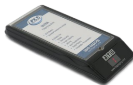
Driver Page Ultra Pager